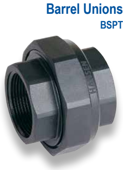
Barrel Unions BSPT

Designed to enable Quick Connect/Disconnect around Pumps, Tanks, Dairy Sheds, Industry and Irrigation.