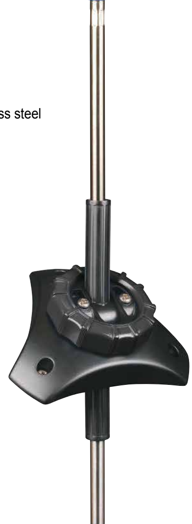
UniTri Mounting Base

The Level Alert in this catalogue is protected by intellectual property rights owned by the Hansen group of companies in New Zealand, Australia & other countries, including NZ patent 596360 and NZ registered design 415007 and Australian patent 2012203010 and registered design 340061. HANSEN is a trade mark of the Hansen group of companies.