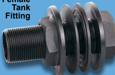
Female Tank Fitting

After the success of the Hansen Polythene Pipe Fittings, Hansen Products decided to design and manufacture a range of True Fit Tank Fittings as there was a high demand for high quality non-metallic fittings. The Hansen range of True Fit Tank Fittings was consequently born and have become well recognised internationally in both domestic and commercial markets for their reliable, dependable sealing capabilities.