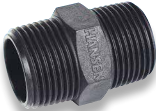
Hex Nipple BSPT x BSPT