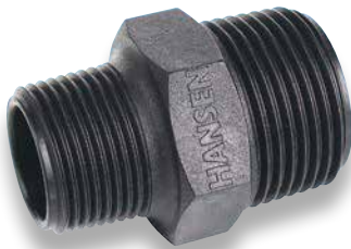
Reducing Hex Nipple BSPT x BSPT

Used as a reducing join, to join two Female Threads.